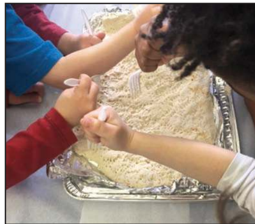
Gan Katan works to make matzo in under 18 minutes!