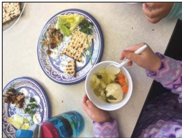
Mmmmm. Yummy. Vegetarian Matzo Ball Soup.