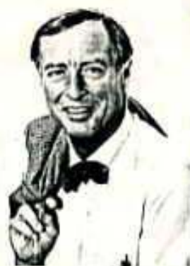
Congressman Lawrence Coughlin