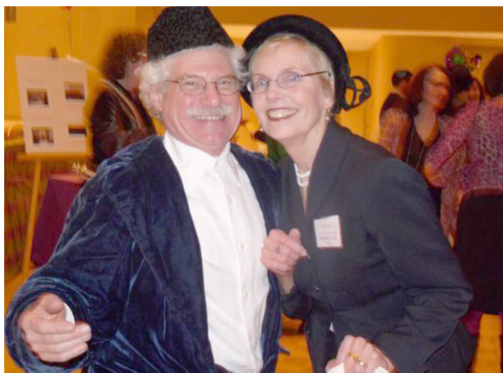
Below - Purim Bash

GJC has cemetery plots for sale at King David Cemetery in the Northeast. Questions? Contact Rachel Gross in the Office.