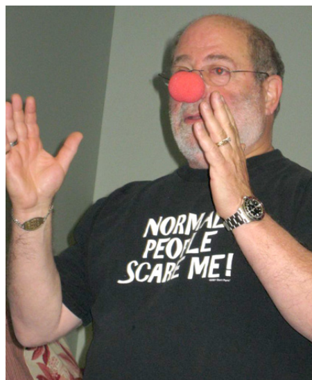
Left - The Stress Less Shrink