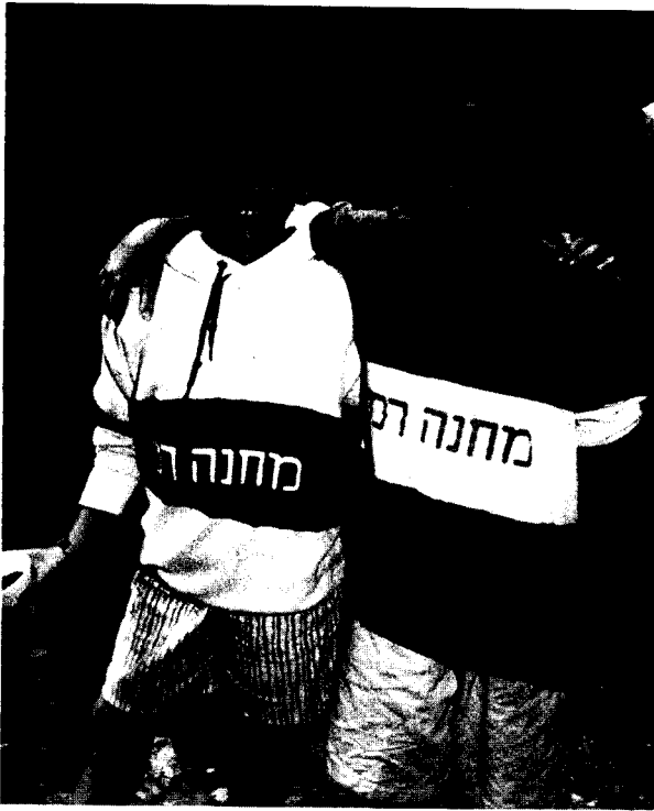
At Camp Ramah, 1986.